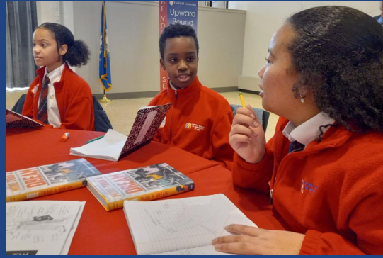
Select CAB middle schoolers participated in a MLK Leadership Academy at Fairfield University and were able to reflect, share and collaborate.