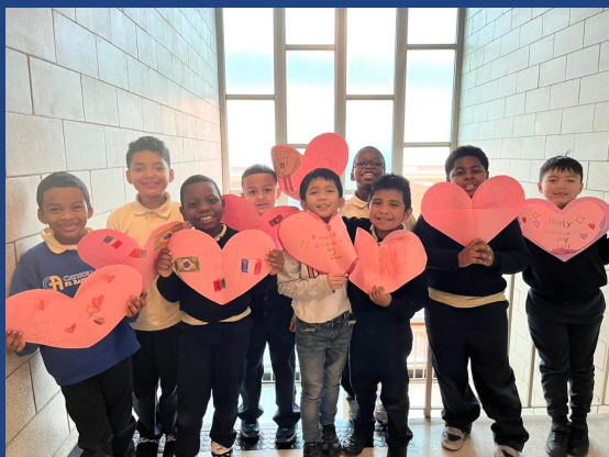
In art class on our St. Raphael campus, students created hearts to show their unconditional love for