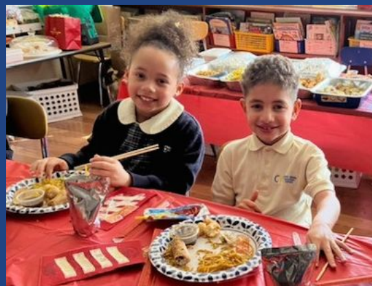
Many classrooms celebrated Lunar New Year with engaging ELA and Social Studies lessons,