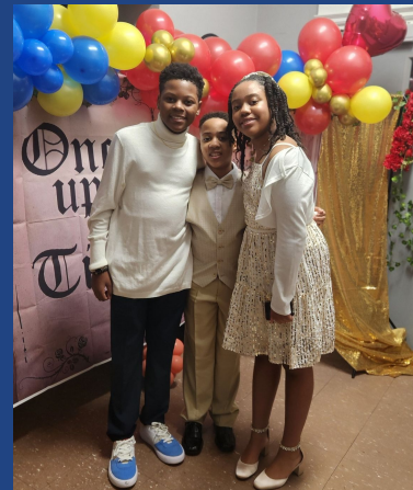
A "Once Upon a Time Ball" was hosted on our St. Ann campus for students and parents.