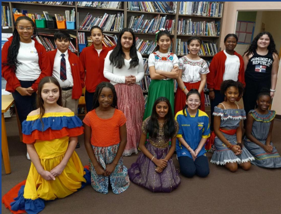
Some of our many St. Ann students who took part in multicultural presentations this month.