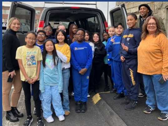
The Student Council on our St. Augustine campus collected bags and boxes of donations for Homes for the Brave.