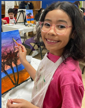
A fun-filled paint night was held on our St. Andrew campus for students and parents of all ages.