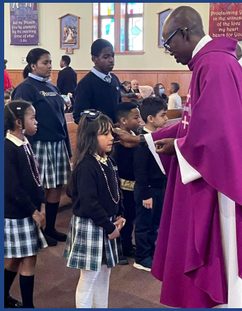
Special liturgical celebrations were held to mark Ash Wednesday and Lent.