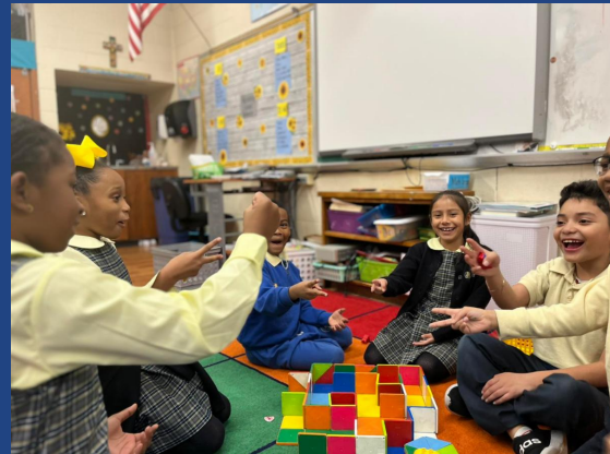
It was all smiles during after-school care on our St. Raphael campus, where students enjoy a safe, engaging and nurturing environment.