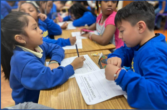
2nd-grade classrooms worked together with friends to make words using the phrase, "Catholic Schools Week."

delicious meals, and other fun activities.